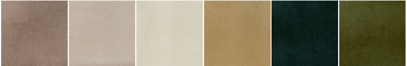
DUB Col 3913